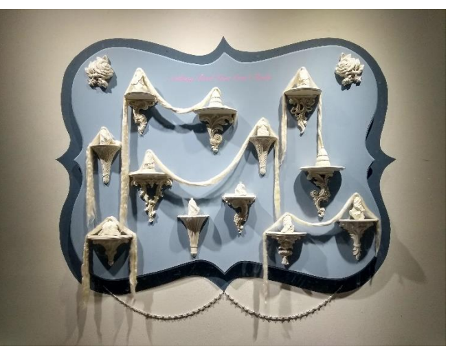
And Though I May Have Lost My Way, All Paths Lead Straight to You, 2013. Plastic wall plaques, porcelain, resin, wooden shelf sconces, Avon glass perfume bottles, silk doll hair, band-strung beads on MDF, latex paint, and vinyl lettering.