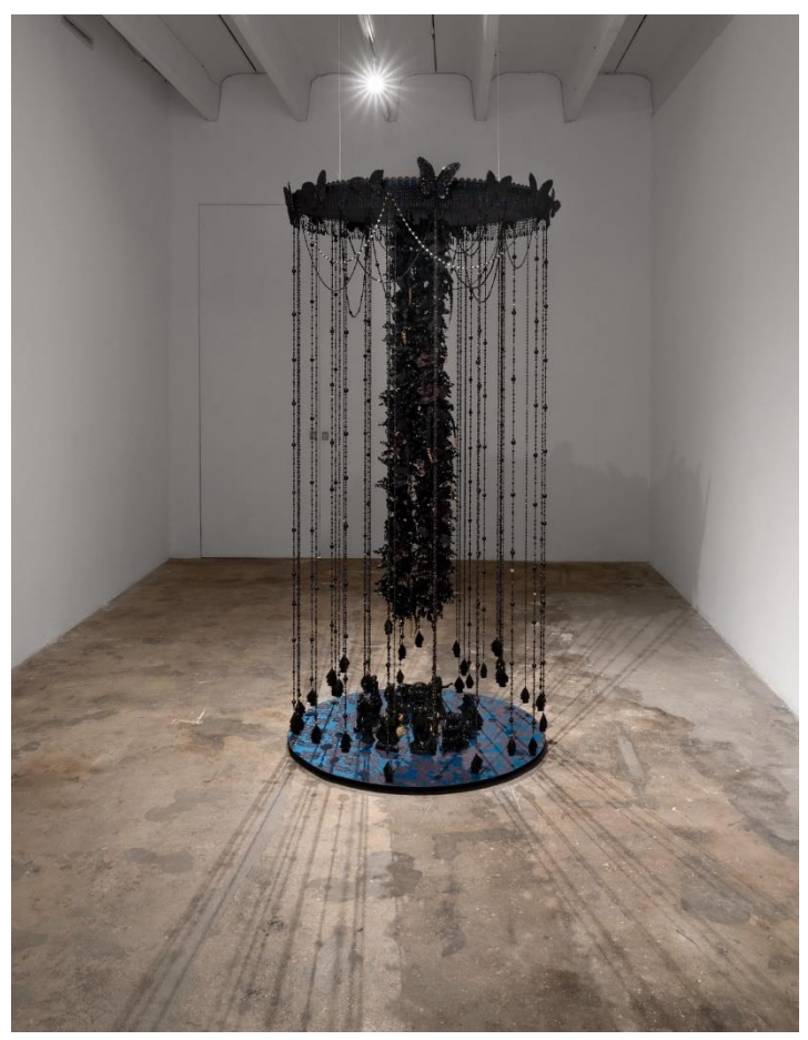
Black Flowers Blossom (Hanging Tree) , 2020. Created to honor George Floyd and the souls of victims of racial injustice. Hand-strung glass, plastic, and wood beads; fabric, plastic butterflies, flowers and foliage; glitter, vintage Avon perfume bottles, and wooden ship bookends.

"I've been collecting these Avon perfume bottles for some time, using them as my muses. They've been deconstructed because I take their heads and torsos off. It's a play on the idea of the Princess — who gets to be the Princess?"