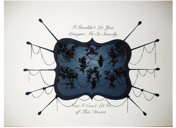
I Can't Say No To You (Good Enough) , 2014. Resin wall plaques, plastic leaves, Avon glass perfume bottles, wooden shelf sconces and ship bookends, jewelry, and hand-strung beads, mounted on shaped MDF panel, latex paint, and vinyl lettering.

She uses vintage Avon perfume bottles shaped like idealized women in period skirts (but removes the tops of the bottles that are shaped like women's heads and torsos); flaxen hair from dolls; galleon ships to represent the slave trade; bracelets, cuffs and jewelry — all interconnected by long strands of glittering Goddess beads. The color backdrops are reminiscent of French toile fabrics. Batons appear, as sails that have lost their wind. "It feels like when you are watching something decay, but know that something better will take its place," says Pierre.